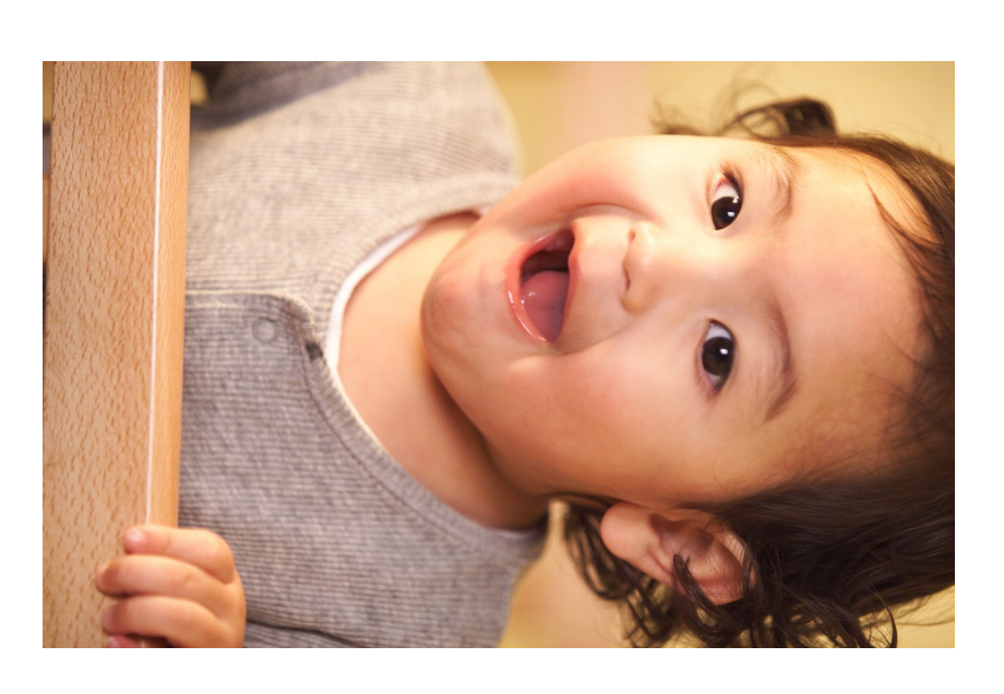
About 3 to 4 babies out of every 1000 babies will have some form of hearing loss at birth.

has a hearing loss, you will want to find out early. Follow-up testing is very important. If your baby