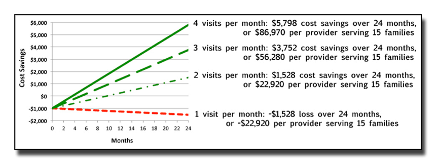
Figure 3. Cost savings for TI when compared to In-person home visit.